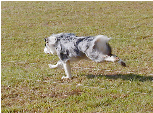
Figure 2. In this galloping dog, the dewclaw is in touch with the ground. If the dog then needs to turn to the right, the dewclaw digs into the ground to support the lower leg and prevent torque.

--from Miller's Guide to the Dissection of the Dog